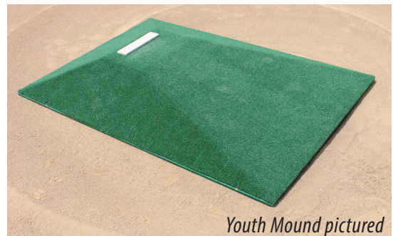
Youth Mound pictured