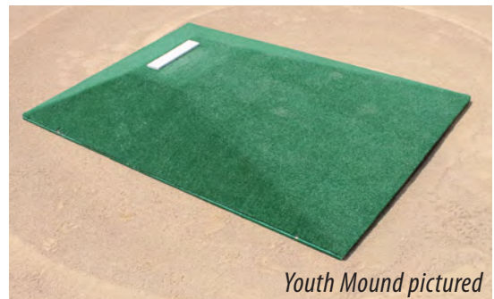
Youth Mound pictured